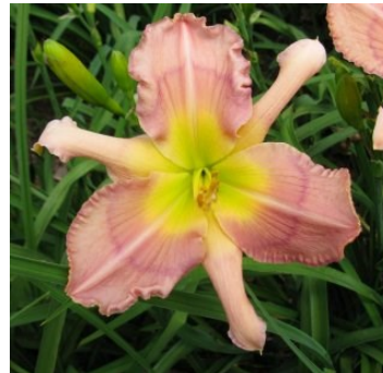
The Sensational Six